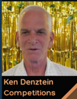
Ken Denztein Competitions