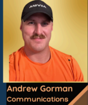
Andrew Gorman Communications